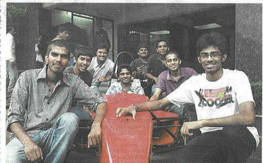
Students of VNR VJIET posing with the prototype formula car they have developed.

Students of a city engineering college have built a prototype racing car that has been selected to represent India