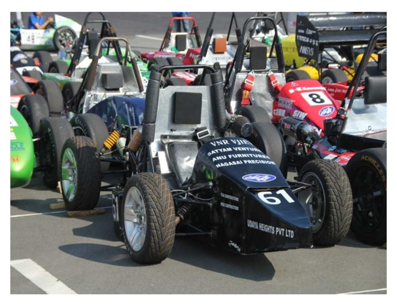
Students of AE & ME have participated in SAE Japan-2012