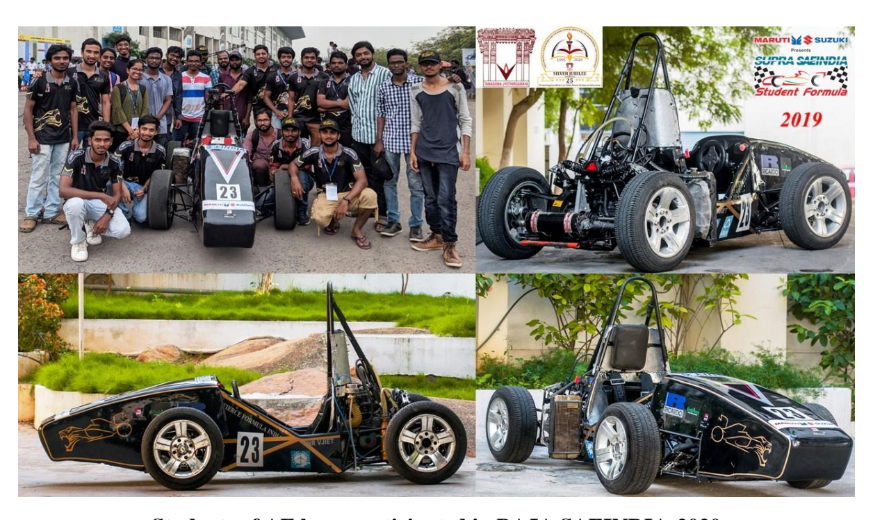
Students of AE have participated in BAJA SAEINDIA-2020