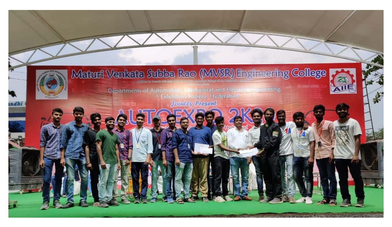
Achieved Frist Prize at Student AUTO EXPO 2020, Hyderabad