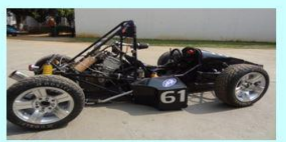
Formula car team in JSAE competition, Japan 2011