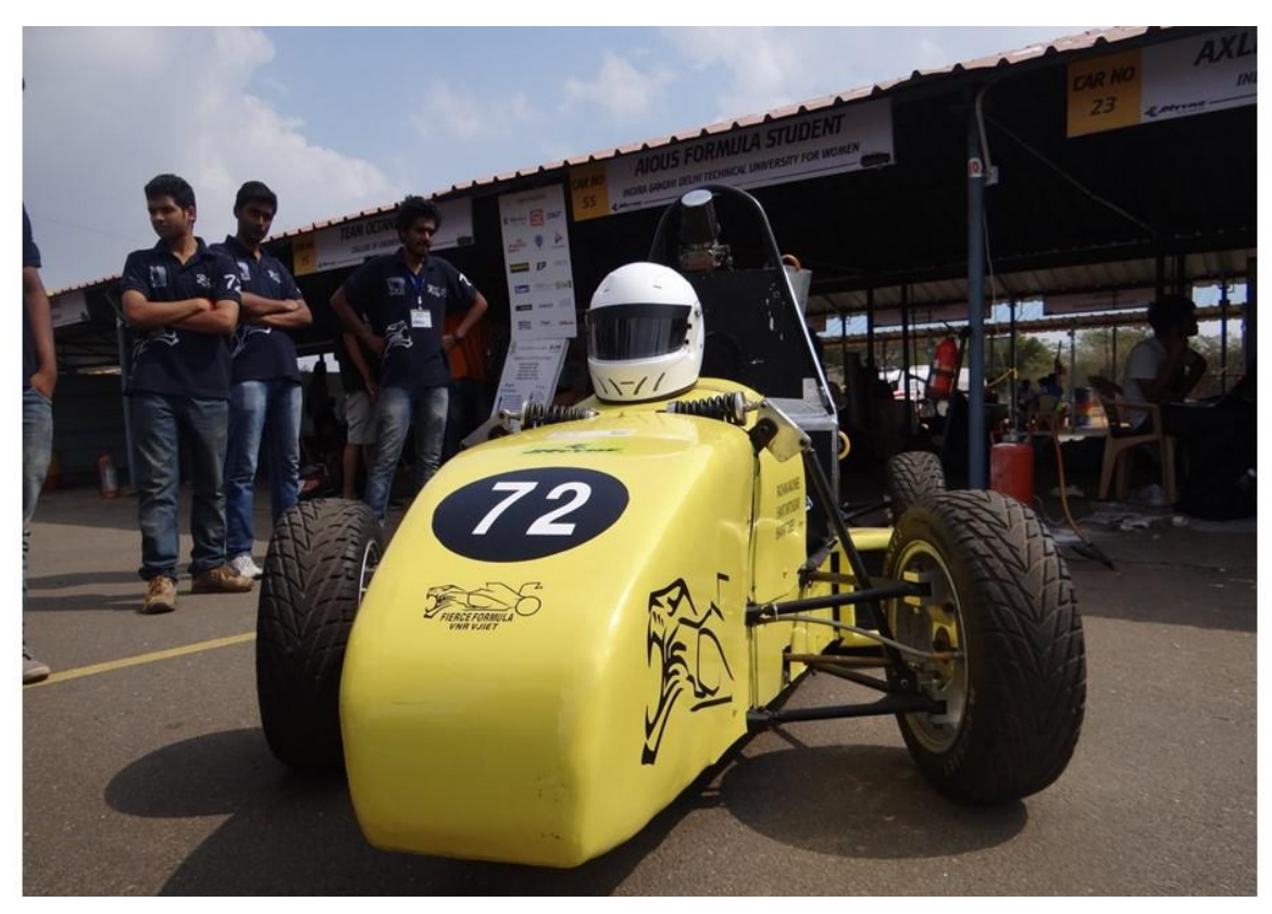
Students of AE have participated in JK Tyre Formula event-2015