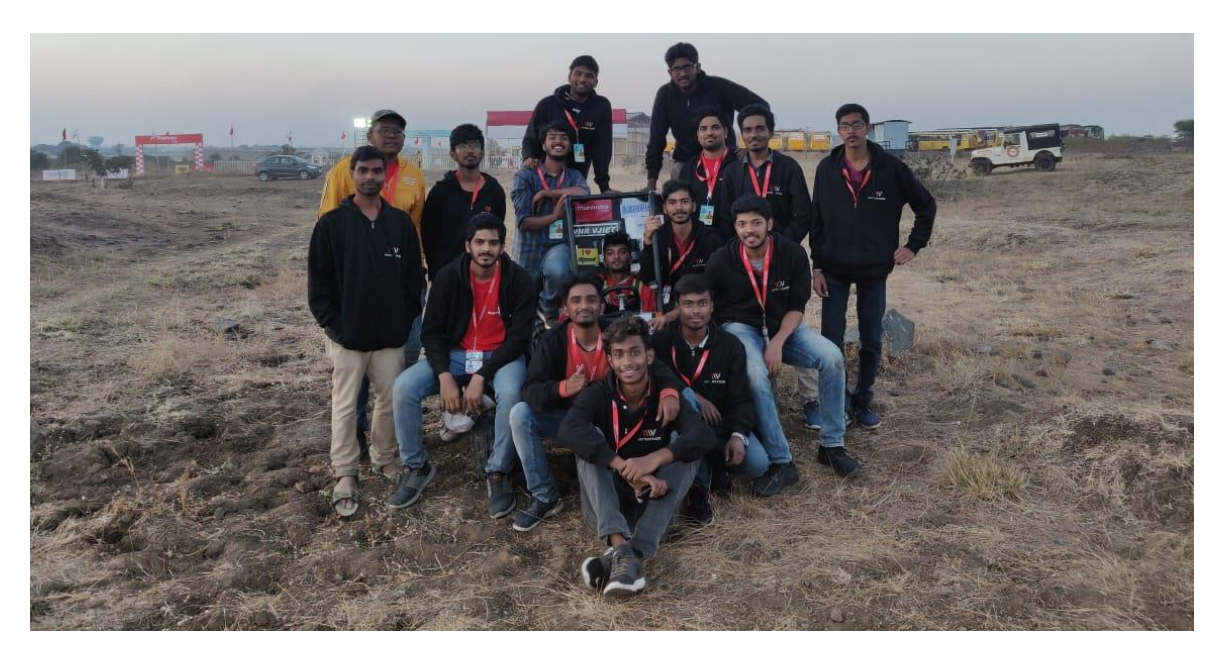
Students of AE & ME have participated in BAJA SAEINDIA-2020