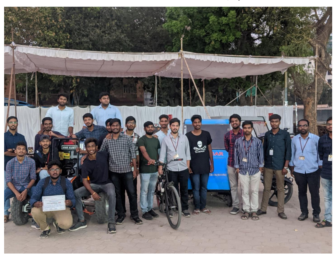
SAE Team in Student AUTO EXPO 2020, Hyderabad