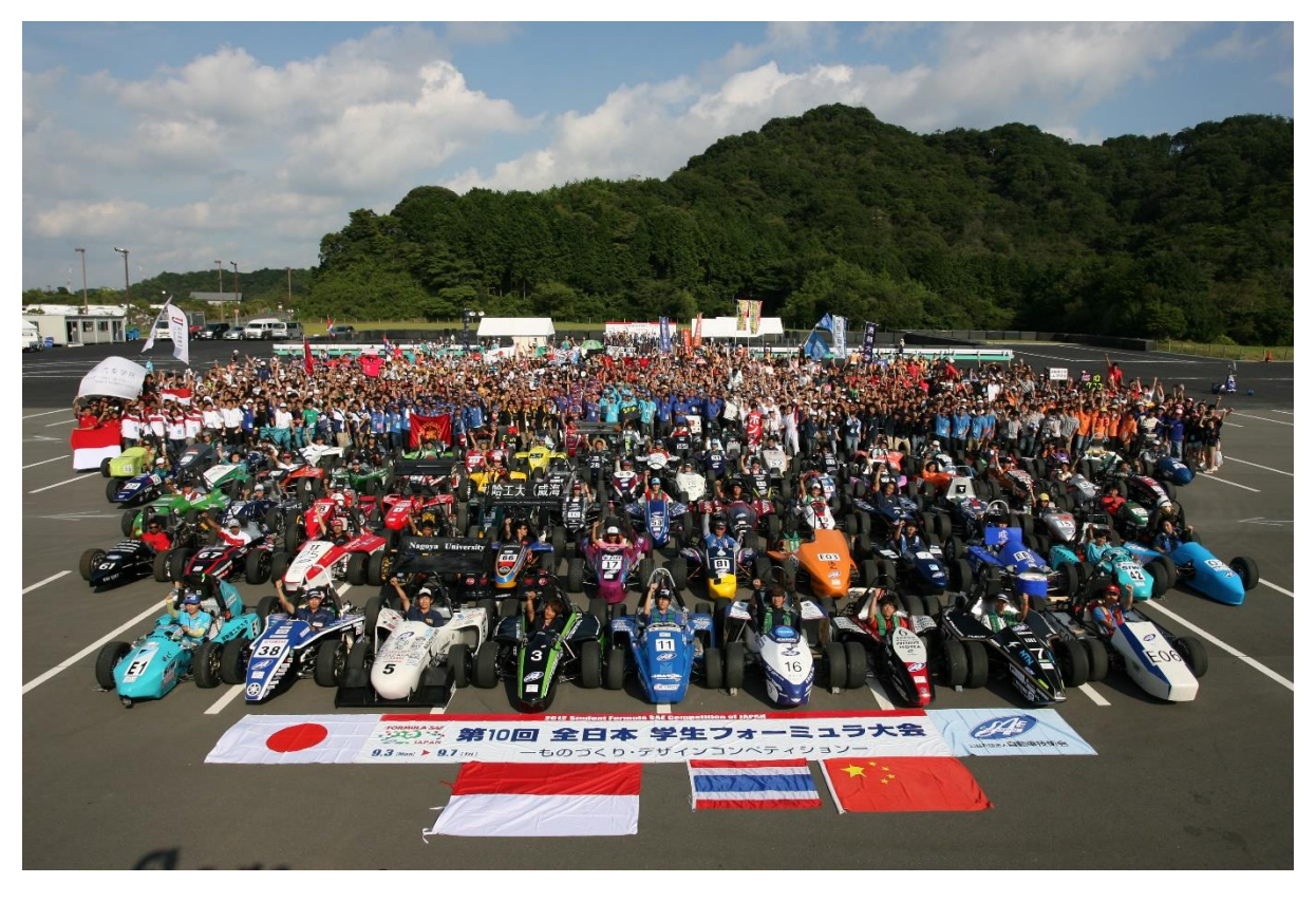
Students of AE & ME have participated in SAE Japan-2012