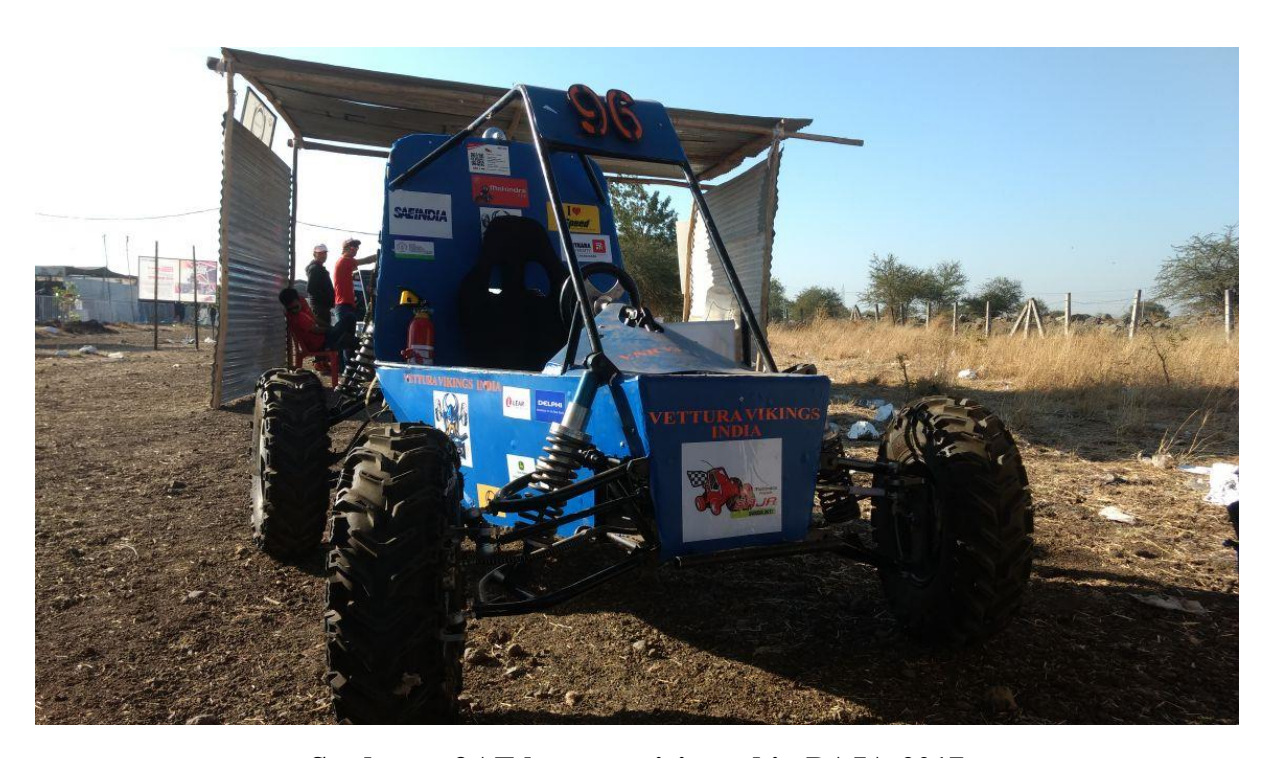
Students of AE have participated in BAJA-2017