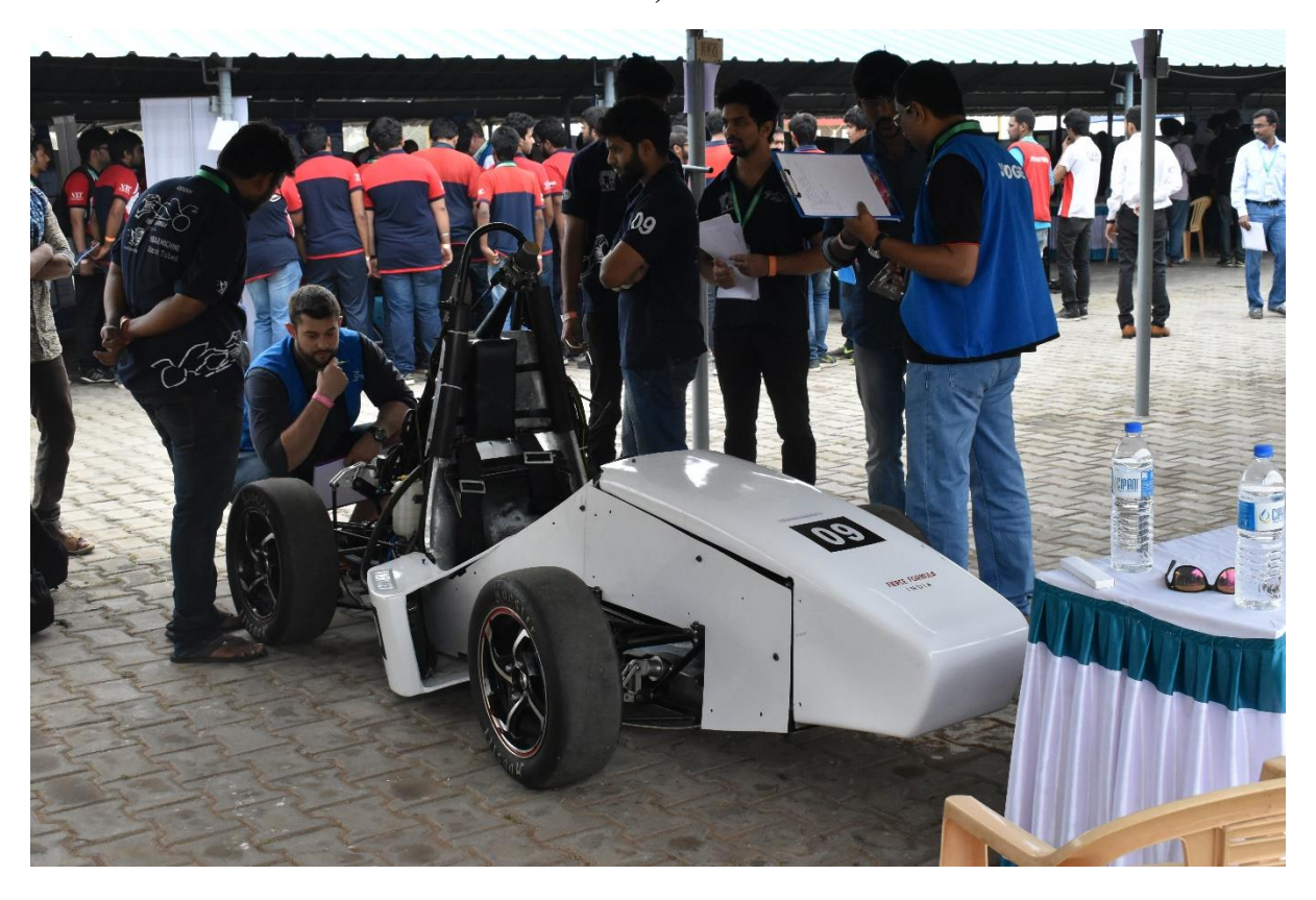
Technical Inspection at Formula Bharat, Coimbatore-2017