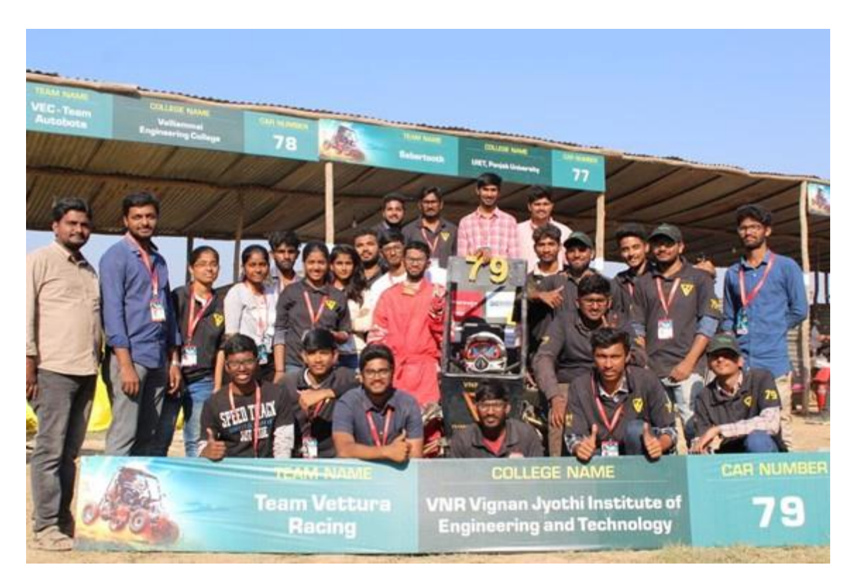
Students of AE & ME have participated in BAJA SAEINDIA at IIT ROPAR from 7<sup>-</sup>10 March 2019