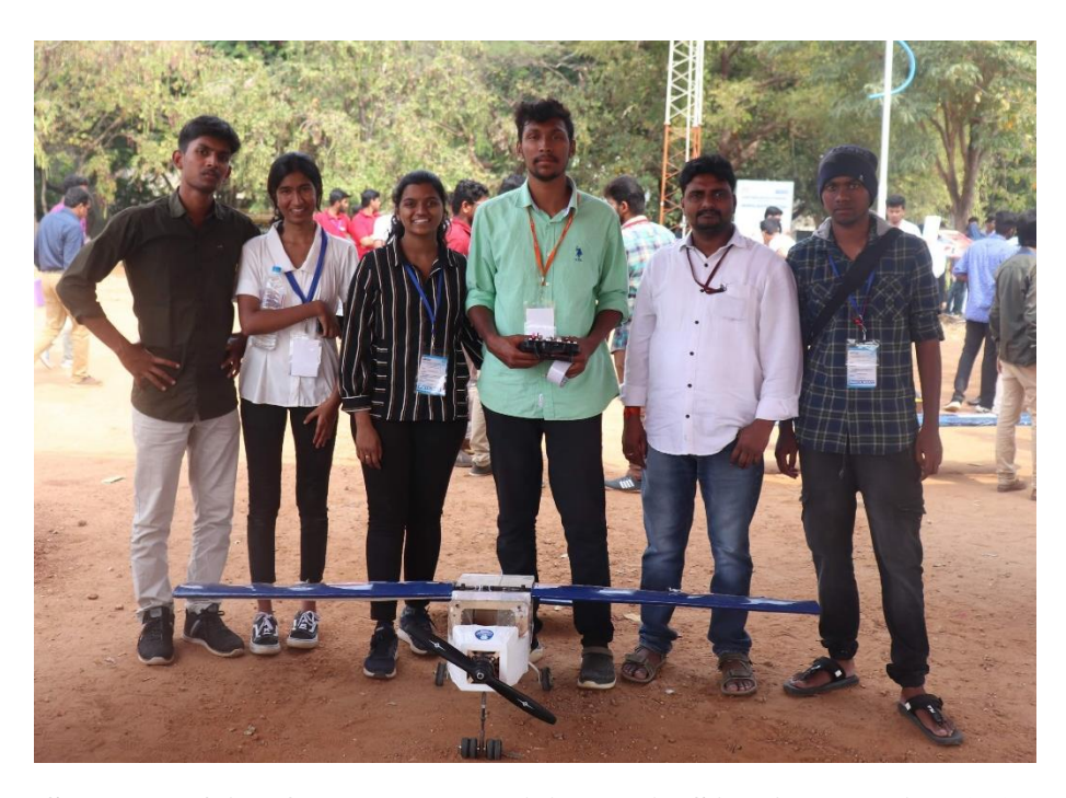
Students of AE & ME have participated in SAE Aero Design-2020