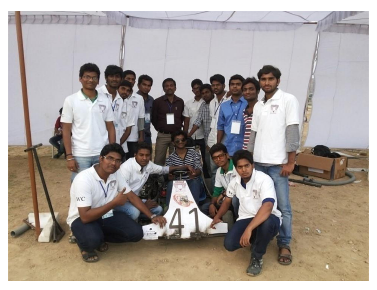
Students of AE have participated in Go-Kart -2014, LPU \,